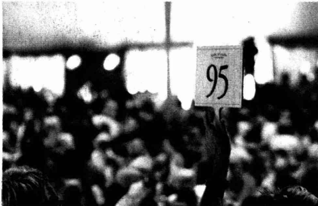
A woman places a bid at Auction Napa Valley on Saturday afternoon.