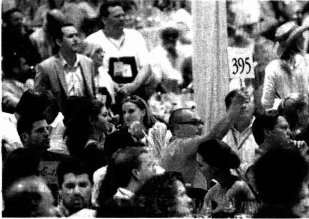
A bidder raises his paddle at the live auction at Auction Napa Valley on Saturday.