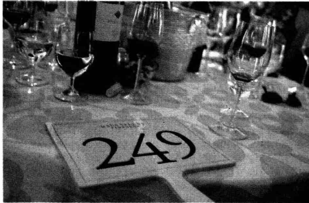
A paddle awaits its bidder at Auction Napa Valley on Saturday.